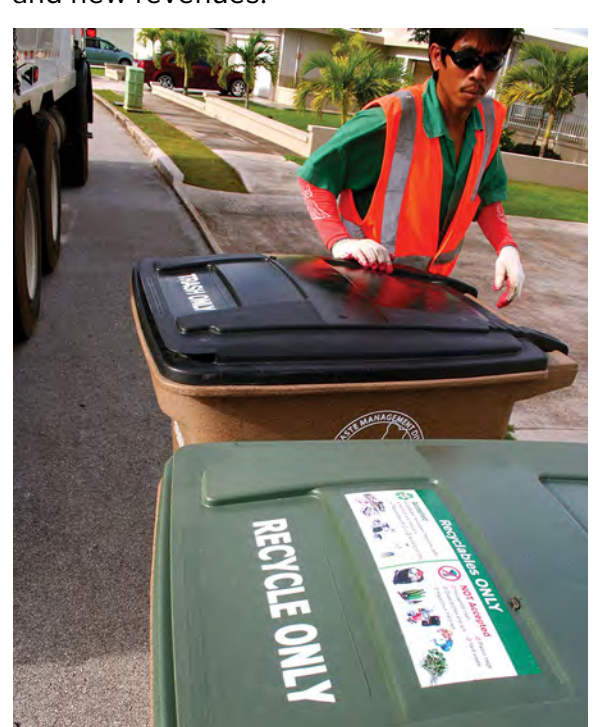
More information at www.gbbinc.com/guam, www.GuamSolidWasteReceiver.org and www. GuamSolidWasteAuthority.com

GBB is proud to have helped hundreds of communities and organizations throughout the country and overseas achieve measurable results in the administration and management of their solid waste systems, including substantial cost savings, efficiencies, increased diversion and new revenues.